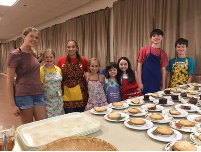
Community Helpers at Community Café. Thank you to all who came to help.