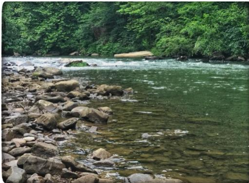
Sights from North Alabama