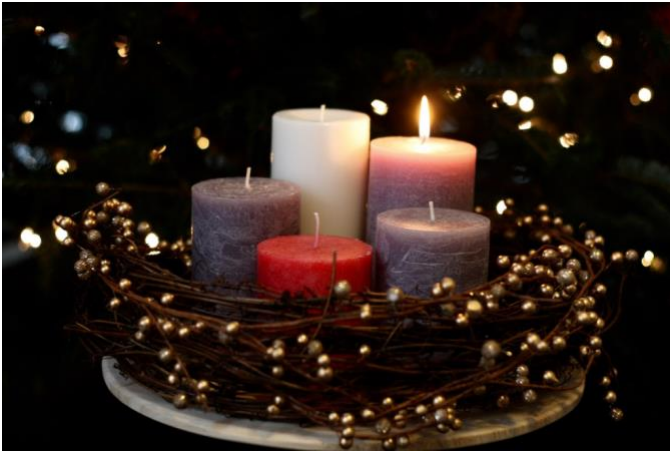
First Sunday of Advent